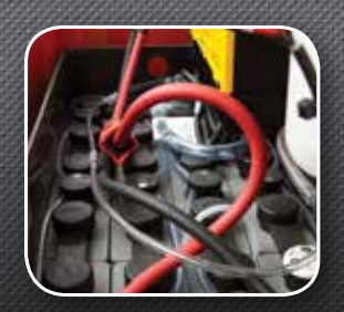
Longer Runtime Efficient electric drive lets you stay on the job longer.