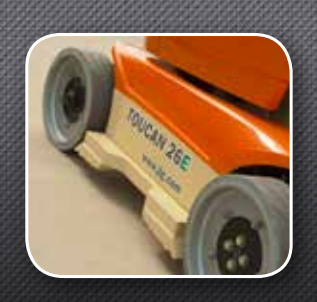
Runs Cleaner Emission-free, environmentally-friendly electric power.