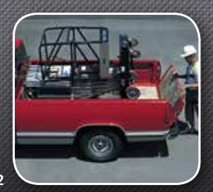
Easy to Transport A roller loading device provides convenient loading.

"The AM Series puts me right where I need to work."