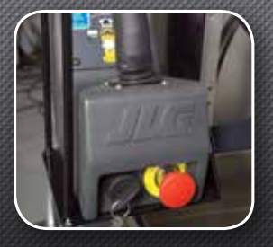
Point & Go® Control System

The JLG Point & Go control system features a single joystick control for smoother drive and lift functions.